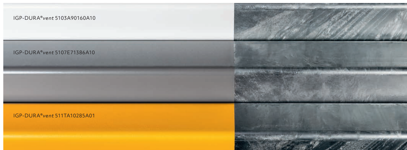
Galvanised profiles – coated with IGP-DURA ® vent 51.

This increases the duration of corrosion protection by between 1.2 and 2.5-fold. Thanks to the introduction of DIN 55633, there is now also a standard to cover duplex systems that combine hot-dip galvanisation with powder coating for steelwork.